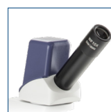
Digital mono head