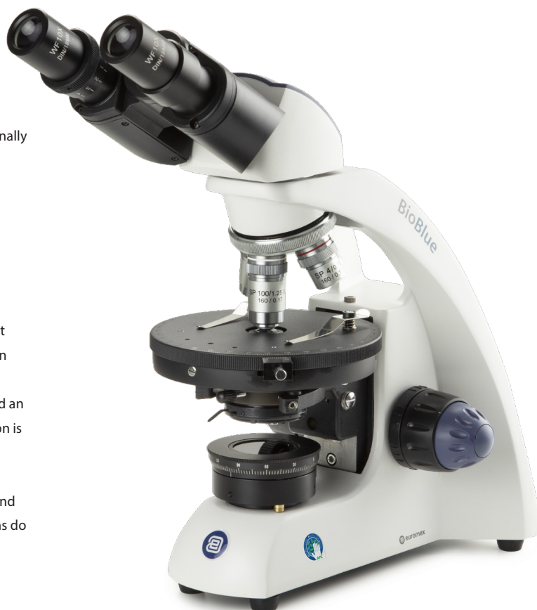
● Polarization model BB.4260-P-HLED

Using the same technology already used extensively throughout the healthcare environment in wall coatings, patient lighting, air pressure stabilization and suction liners, APL prevents the growth of unwanted microbes that can cause degradation, discoloration, staining or odors of the Euromex microscopes