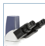
Digital bino head