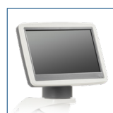
Digital LCD head